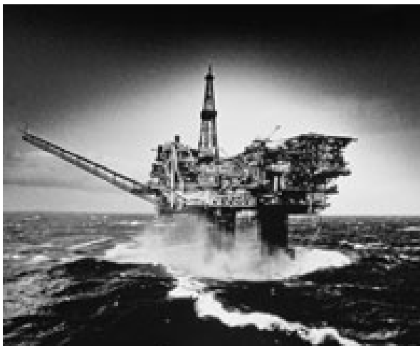
The material had to withstand the rigours of the North Sea

The properties of epoxy intumescent - including chemical, impact and weather resistance - also needed to withstand jet fire blowouts and explosions. Such benefits, it was soon realised, To understand how this development has come about, it is helpful to trace the origins of epoxy intumescent. The medium was first prepared to offer exceptional fire protection for the offshore petrochemical industry. The material had to withstand the rigours of the North Sea in order to protect oil platforms for up to 3 hours in hydrocarbon fire conditions.